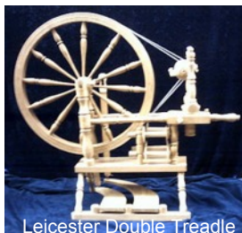
Leicester Double Treadle